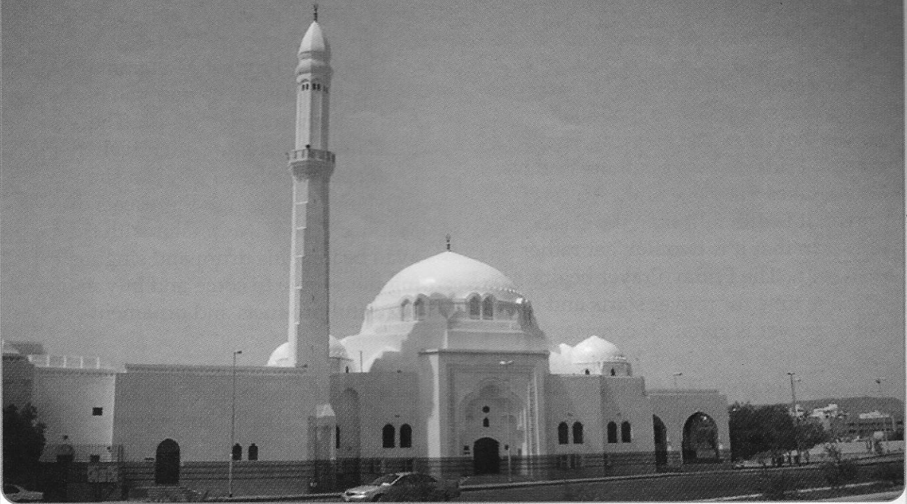
Masjid-ul-Jumu'ah in Madina, it's built on the place where the Prophet made the first Jumu'ah prayer in Madina